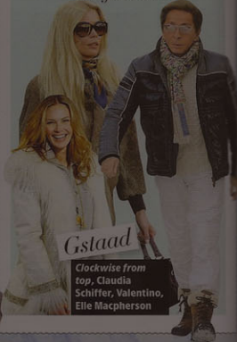
Clockwise from top, Claudia Schiffer, Valentino, Elle Macpherson